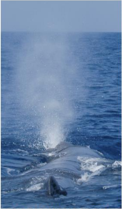
THE BLOWHOLE IS ON THE LEFT SIDE