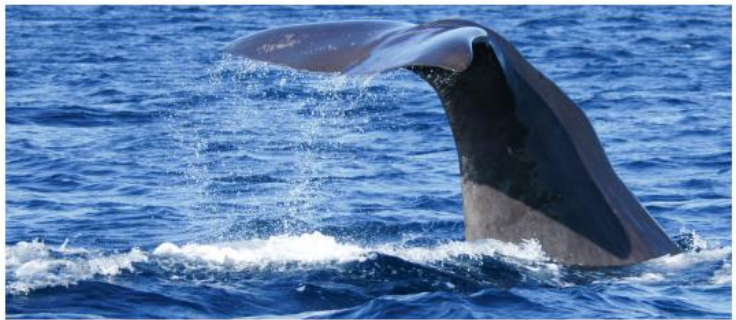
FLUKES when starting deep dives