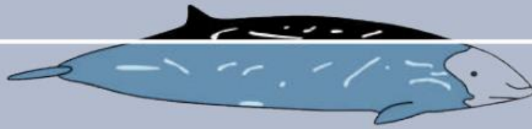
Ziphius cavirostris Zifio Ziphius